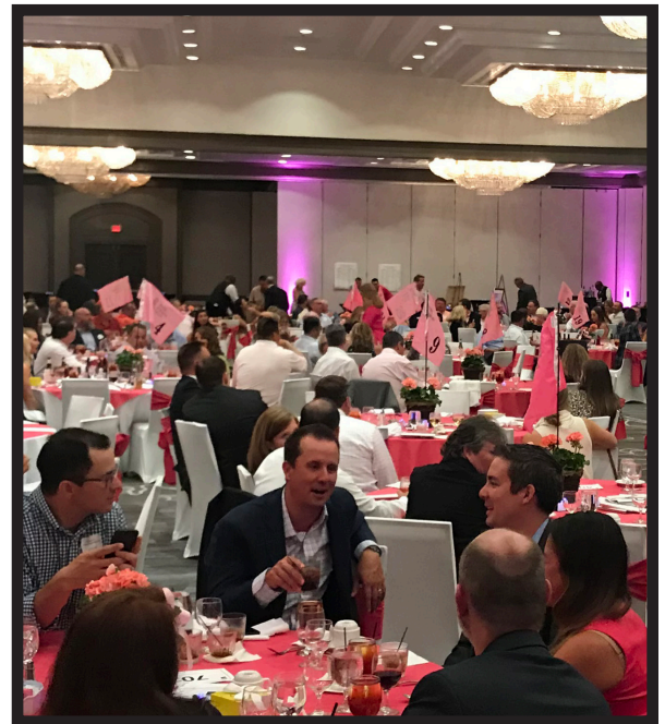
2019 Pairings Party | Hilton Memphis